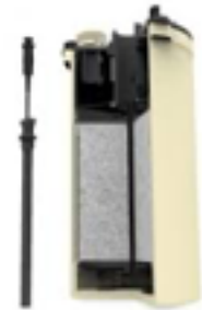
Figure 4 - Thermal front monitor – AP Diving

While thermal array monitors are a good steady state system, accuracy is challenged in shallow and warm water and it cannot predict bypass as a result of high workload.