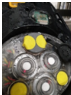
Figure 3 - Experimental CO 2 sensor

More recently a form of CO 2 sensor has been used for diving with rebreathers. It is known as a non-dispersive infra-red (NDIR) sensor. Put simply, using infra-red light it measures the spectral response of CO 2 when the light is passed over it. Unfortunately, the spectral response of water is similar to CO 2 and can also be detected. This can create a 'false positive' (high reading) and a shorter dive endurance, which in itself can be seen as a 'fail safe' scenario. Some manufacturers have successfully integrated NDIR sensors in rebreathers with additional moisture filtration, sometimes at the expense of sensor response time and long duration use (due to filter degradation) is still potentially an issue. Gas density can also affect these sensors but can in most cases be compensated for.