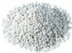
Figure 5 - Absorbent friability should be considered

Conversely, if you diving is deep, long and cold then ideally would want the best performing product possible from an endurance perspective. That should be balanced against any work of breathing issues of a potentially more densely packed (smaller granules) absorbent if that is the choice, much of the latter being mitigated by using the correct diluent at depth.